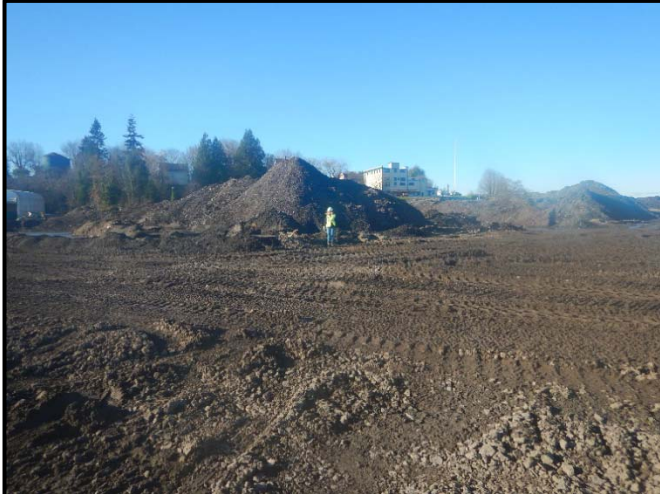
One of our many stockpiles, with an employee standing in front of it for scale.